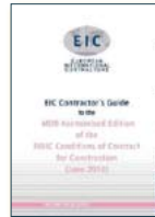
EIC Contractor's Guide to the MDB Harmonised Edition of the FIDIC Conditions of Contract for Construction (June 2010), "The Pink Book Guide", 2011