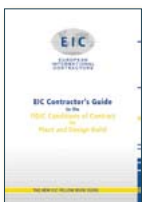
EIC Contractor's Guide to the FIDIC Conditions of Contract for Plant and Design-Build, 2003