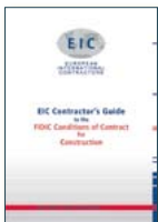
EIC Contractor's Guide to the FIDIC Conditions of Contract for Construction, 2002