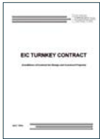
EIC Turnkey Contract, 1994