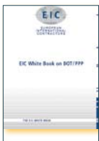
EIC White Book on BOT/PPP, 2003