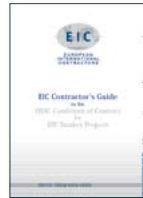
EIC Contractor's Guide to the FIDIC Conditions of Contract for EPC Turnkey Projects, 2003