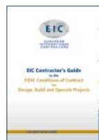
EIC Contractor's Guide to the FIDIC Conditions of Contract for Design, Build and Operate Projects, 2009

For FIEC publications, please refer to p. 64