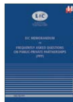
EIC/FIEC Memorandum on Frequently Asked Questions on Public-Private Partnerships (PPP), 2006